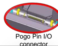
Pogo Pin I/O connector