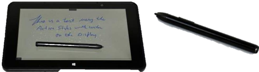
KT-ET5X-ASTY1-01 (WIN, 10" only) KT-ET5X-ASTY2-01 (ANDR)